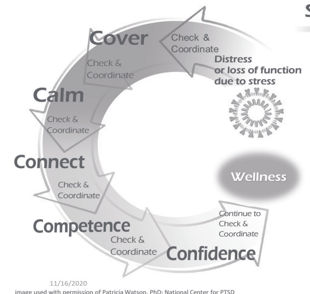
FIGURE 3. The Seven Core Actions of Stress First Aid: The "Seven Cs" (reprinted with permission from Nash et al., 2009)

1. Check: Watch for indicators of stress response in self and coworkers, determine how other members of the team are being affected, and decide what can be done next to manage the stress in a healthy way.